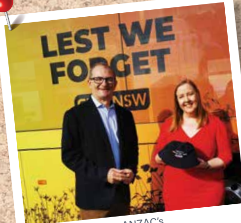
Paying tribute to our ANZAC's