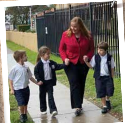
Walk Safely to School day with the students from East Maitland Public School