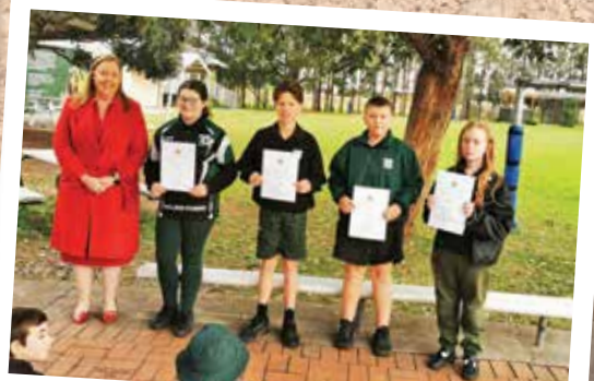
Acknowledging school leaders at Millers Forest Primary School