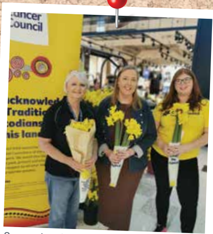
Supporting the Cancer Council