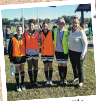
Beanies for Brain Cancer round at Maitland Junior Football Club